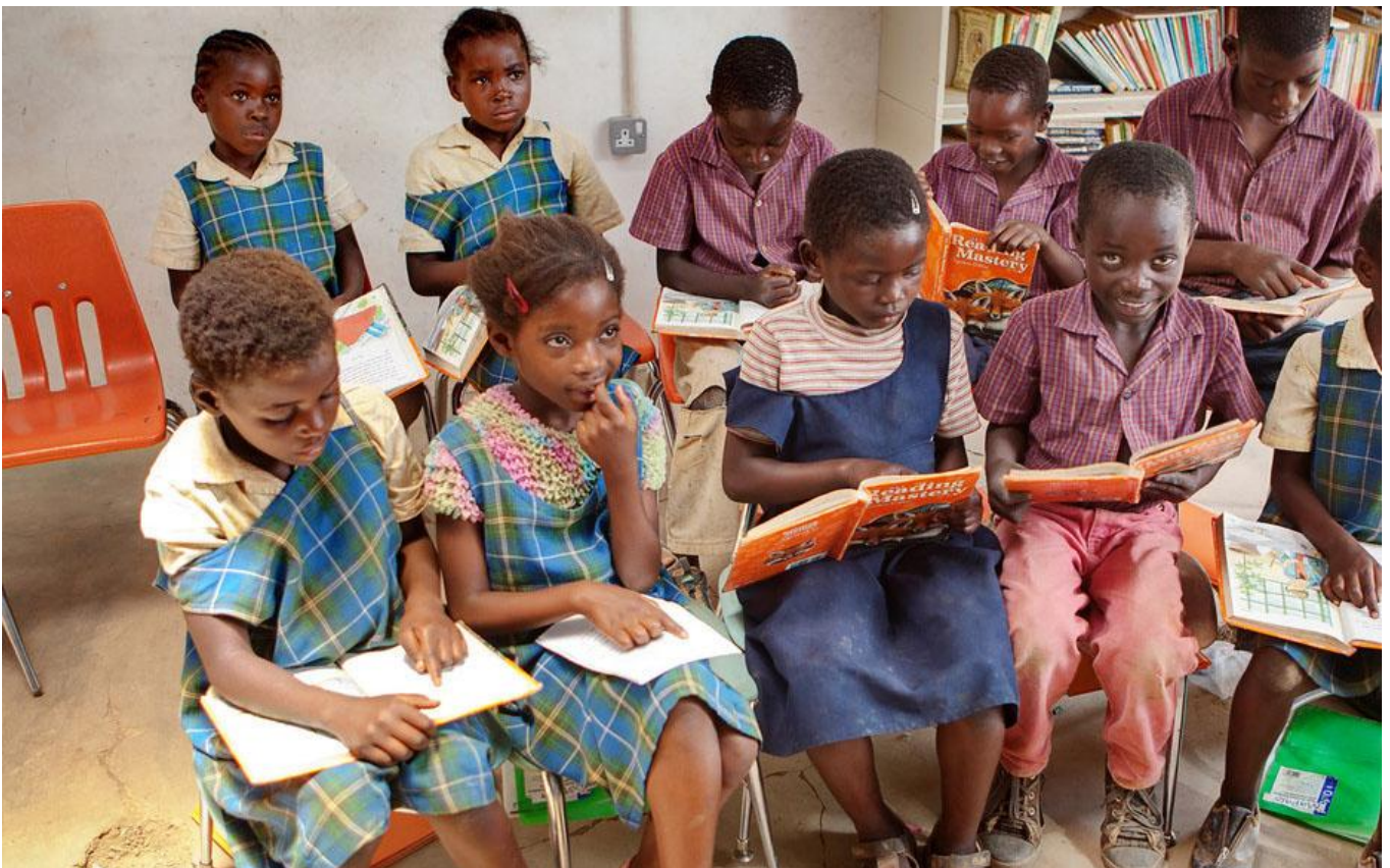
Zambia: Children from Mother's without Borders School reading together in class